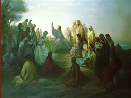
Dore, Jesus Preaching on the Mount